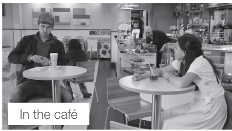
In the café